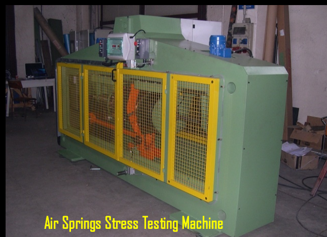
Air Springs Stress Testing Machine