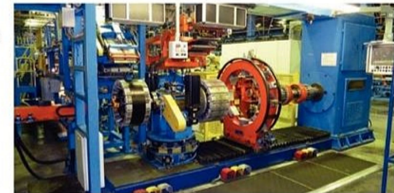
Left: Two views of the Intereuropean Intertech system

FOR MORE INFORMATION 003 Intereuropean Srl Tel: +39 0293 84351 Email: info@intereuropean.it Web: www.intereuropean.it