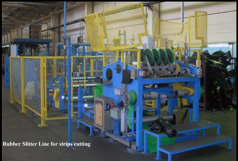
Rubber Slitter Line for strips cutting